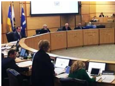
The tide of public support has turned against Co-op Refinery as Regina City Council calls on Premier Scott Moe to legislate an end to the lockout.