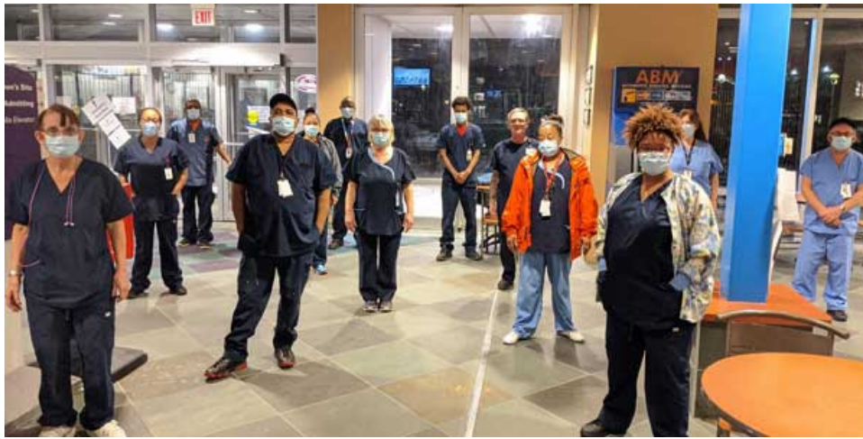
The situation in long-term care is critical. Thousands showed support for Online Day of Action urging Doug Ford to make changes now!