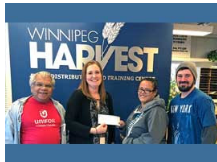
Unifor locals in Western Canada celebrated May Day this year with a massive donation to food banks.