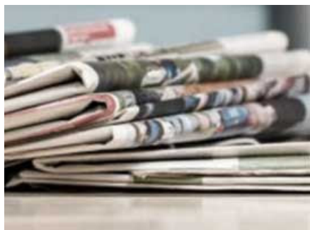
Ottawa needs to take on Facebook and Google as COVID-19 throws media into deeper crisis, says Jerry Dias in a message to the federal government.